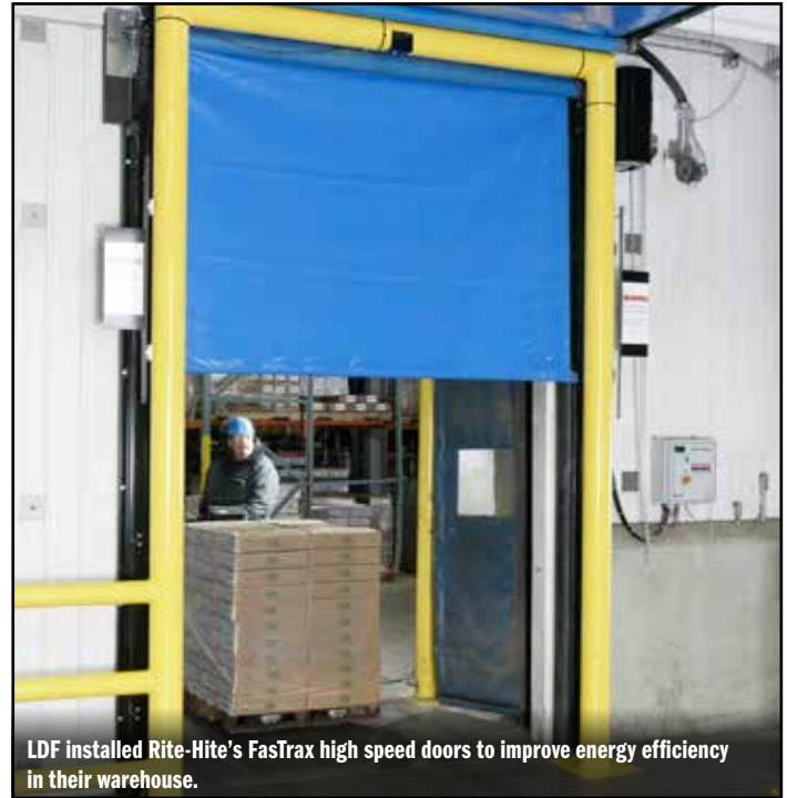
LDF installed Rite-Hite's FasTrax high speed doors to improve energy efficiency in their warehouse.

All the new dock stations were outfitted with energy-saving dock shelters. For some, Fleming chose Eliminator II , a fully impactable shelter that offers full-access sealing around the trailer. And for others, he chose the ComboShelter , designed to handle a wide range of trailers, including those with lift gates and other rear extensions.